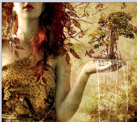
Figure 1: Attention energizes and intention transforms. Using these attributes in conjunction with unattachment is a powerful tool to manifest great benefits into your life.

When you wish to end the meditation, “release” the mantra and bring your focus back into your body. Now, take long, deep inhalations and corresponding exhalations for about a minute. When you are ready, open your eyes and begin your day. As you move forward with your life, occasionally place your attention on the three or four intentions you scribed within the bottle. Don’t rush or be attached to the outcome. The universe will take care of the details.