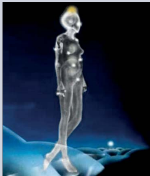
Figure 1: Cosmic, Collective and Personal Consciousness are infinite and connect all matter in the universe. They also completely penetrate the “nothingness” of infinity.

instantly – faster than the speed of light. It is the consciousness at work when you think of someone, and in a matter of minutes or seconds, the telephone rings with that person on the other end. And it is the consciousness at work when you seek to manifest something into your life. Cosmic, Personal and Collective Consciousness are infinite and intimately connected.