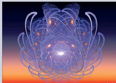
Figure 3: Through the infinite presence of Consciousness, it is possible to manifest your dreams and desires through intention and attention with detachment