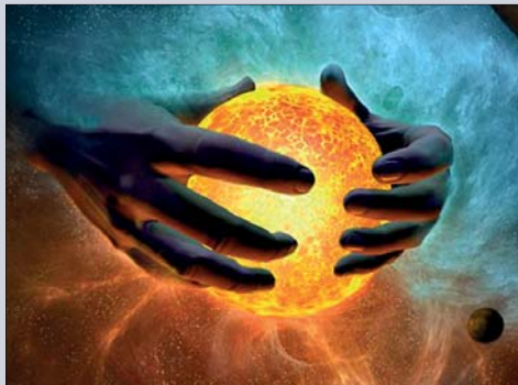
Figure 3: Womb of Creation. What is the nothingness from which everything in the universe comes – you, me, planets, the entire universe? Is it just a void, or could it be the womb of all creation? Is it possible that Nature goes to exactly the same place to create a galaxy of stars, a cluster of nebulae, a rainforest, a human body or a thought? Some sages, geniuses, and psychotics have figured it out.

What we call the picture of the world is not the look of it; it’s not what we perceive with our five senses. It is an on-off signal that has been going on and off for all eternity. It is this on-off signal that gives us our experience of the world. We need the on-off signal to have the experience of the world and the universe. Without the off there is no on. Without the on there is no off. That’s what a discontinuity is – something that is vibrating on and off. When you see a light moving around a Christmas tree, there is no light actually traveling around the tree. The effect is created by light bulbs going on and off in a certain sequence, in which we cannot see the off, but only see the on, so our senses perceive and transmit the picture of a moving light within our consciousness. The same effect occurs in the sensory transmission of neon signs. Lights are not moving; bulbs are just going on and off in a prescribed sequence. This again is a discontinuity – a signal vibrating on and off. Another example