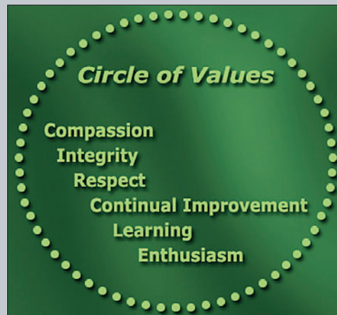
Figure 2: In creating a Life Plan, it is critical that you identify with complete honesty, the values that underpin the decisions in your life. There is no right answer, only your personal truth.

Healthy, wise and fulfilled employees achieve not only employee engagement , but employee enjoyment as well, and their capabilities to perform increase exponentially. That's why, as Arianna points out, 25 percent of corporations in the U.S. have now instituted some kind of mindfulness program, e.g., meditation, yoga, etc. And I am not talking about cutting-edge Silicon Valley firms. This includes the likes of, multibillion dollar companies like Target, Aetna and staunch Midwestern firms like General Mills. They understand that companies which embrace Balance and the elements of the Third Metric not only do good, but they also do very well on the bottom line. There have been numerous studies to demonstrate this is unequivocally true. 6