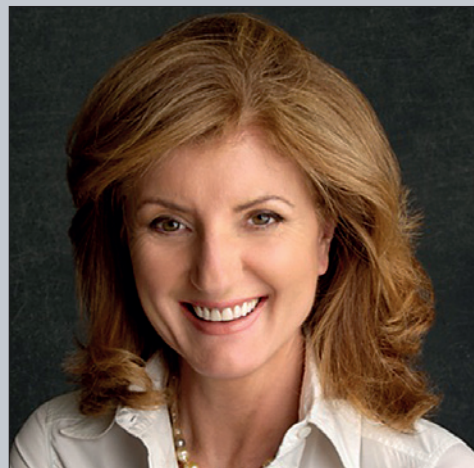
Figure 1: Arianna Huffington, founder and president of the Huffington Post is considered one of the most powerful women in the world.

Arianna rightly points out that because of the Two Metric value system, long propagated and admired by the majority of society, healthcare costs continue to escalate. Anti-depressants are growing at nearly 10 percent per year, 1 soaring more than 500 percent over the last 20 years. 2 Prescriptions for sleeping pills are skyrocketing. 3 Most of this increase is due to stress and high blood pressure in the workplace. Women in particular are experiencing the impact with a 40 per-