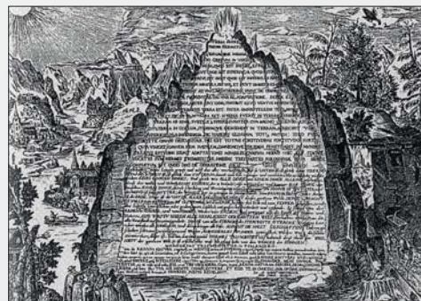
Figure 2: A 17th Century etching depiction of the Emerald Tablet by Heinrich Khunrath

more dama-ging to the skin, rather than providing the healing properties purported by the manufacturers. Mcely Bouquet™ products are used exclusively in Mcely SPA, and currently sold only at Chateau Mcely and at its Boutique E-Shop ( http://www.chateaumcely.com/eshop/en/mcely-boutique/ ).