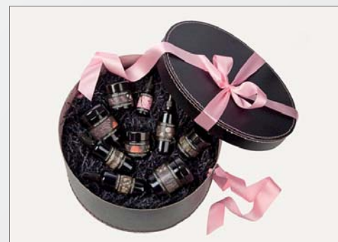
Figure 3: Mcely Bouquet products are made in Chateau Mcely's on-site laboratory using proprietary alchemical methods and are completely natural and healing, containing no synthetic fillers, alcohol or chemicals.

www.mcelybouquet.com/en/unique_gifts.php